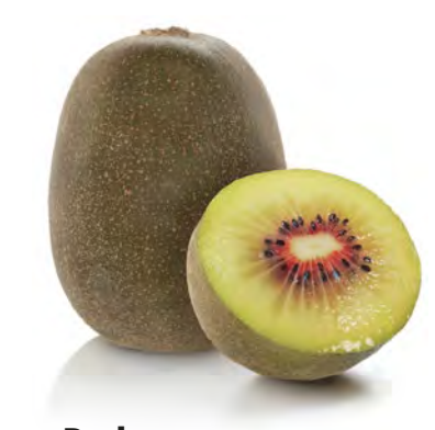
Red (Red Passion, Don Hong)

They are smooth, with no fuzz on the skin, and typical for the bright yellow color of their flesh. They have zero acidity and a sweet taste.