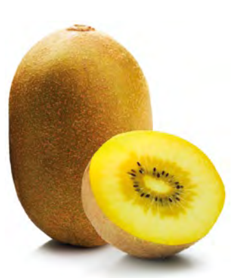
Yellow (Dori, A19, Jinyan)

They are smooth, with no fuzz on the skin, and typical for the bright yellow color of their flesh. They have zero acidity and a sweet taste.